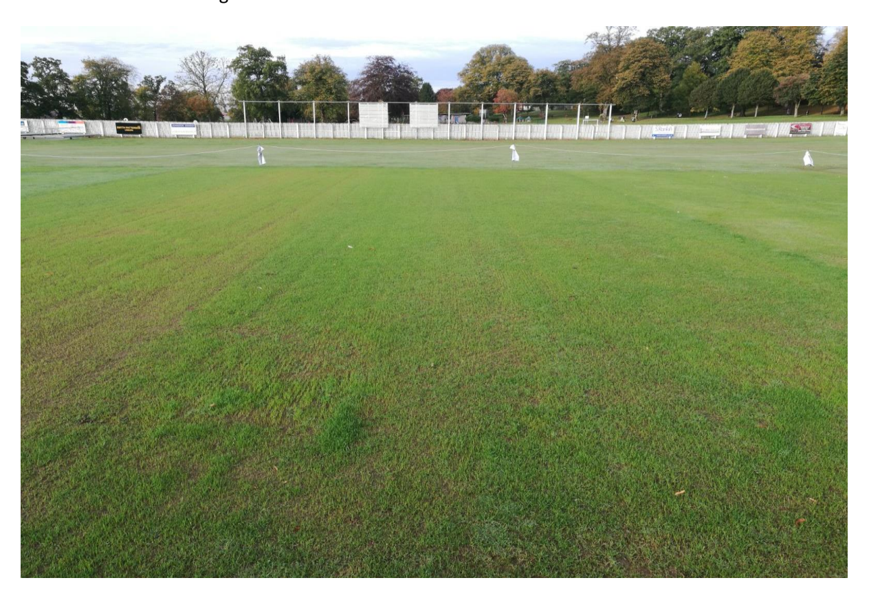
6 – 7 weeks after seeding